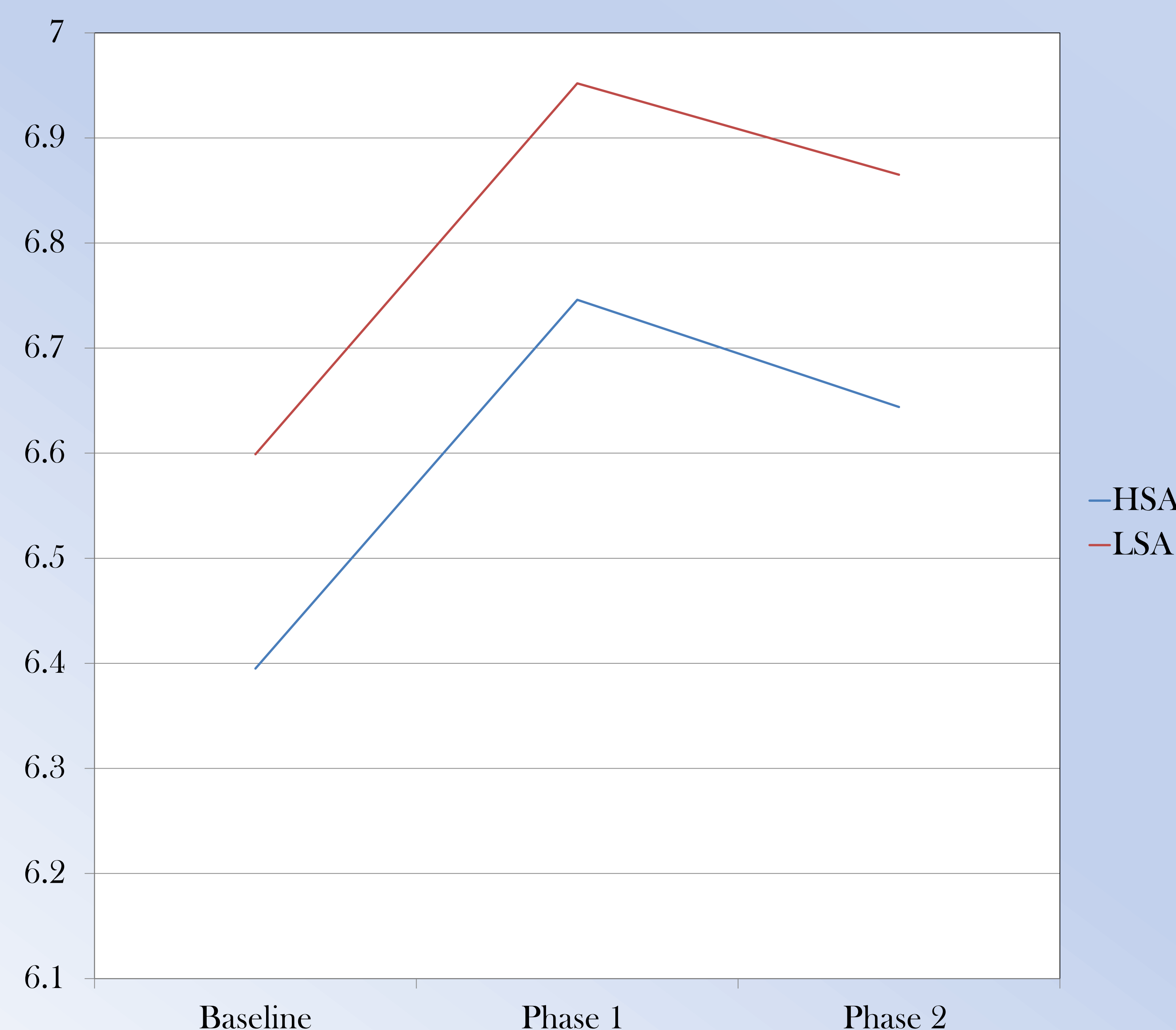
Figure 2. Mean RSA score at baseline, Task Phase 1 and 2 of LSA and HSA individuals.